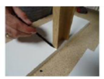
Mark the position