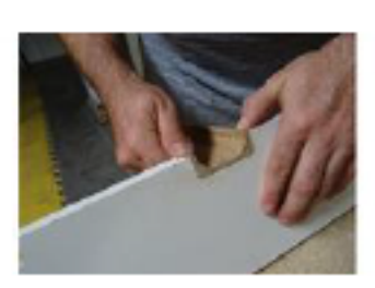
Check the fit